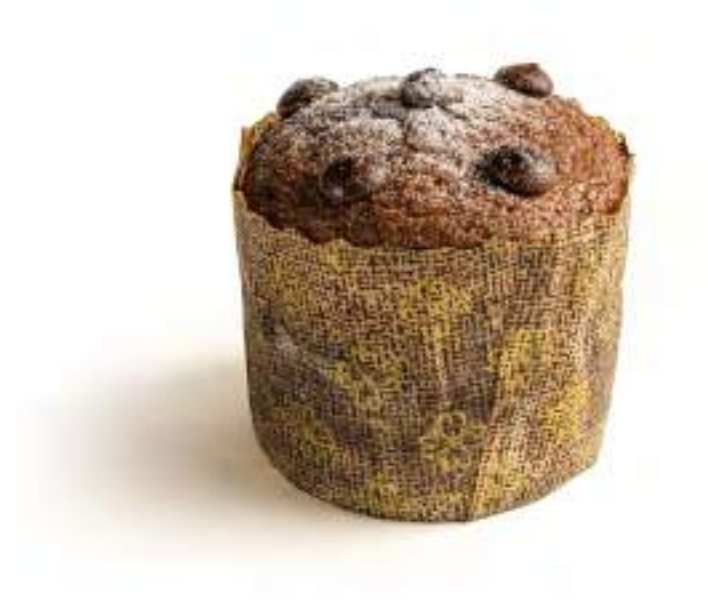
SILKY CHOCOLATE Dark chocolate chips, Indonesian espresso grounds.