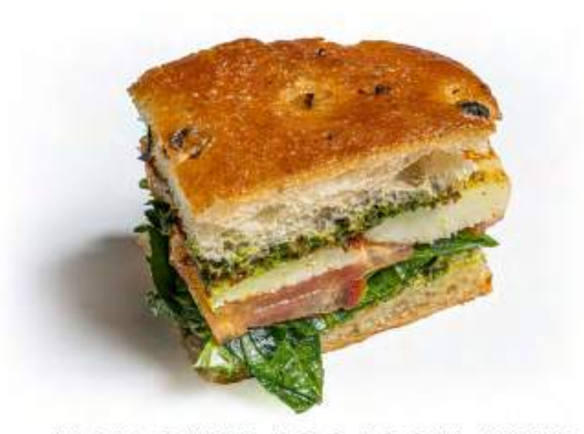
HALLOUMI FOCACCIA MINI Grilled halloumi, olive focaccia, pesto, tomato, arugula.

BBQ CHICKEN MINI Home-made BBQ sauce, pulled chicken.