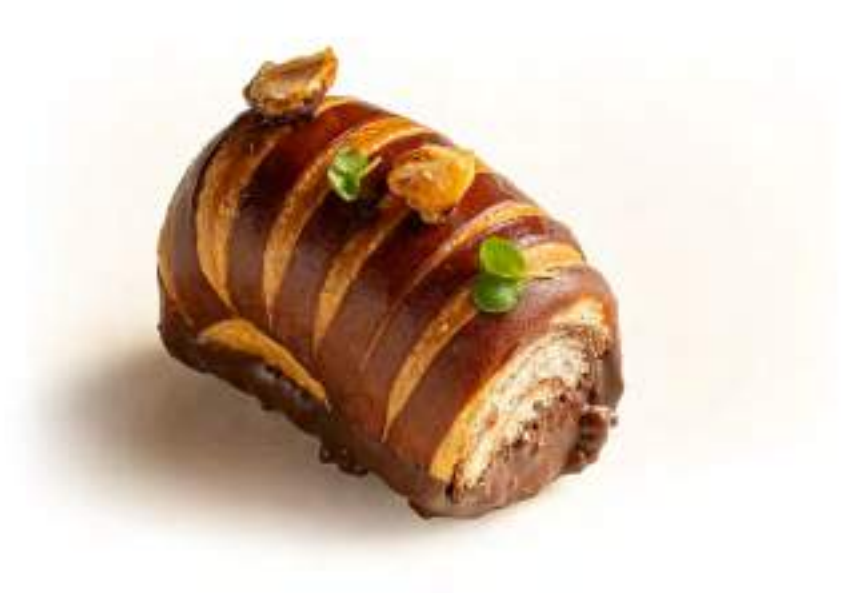
GIANDUJA Home-made hazelnut milk chocolate filling.