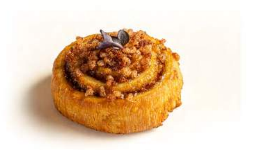
KANELBULLAR Brown sugar, cinnamon, cardamom, pastry cream.