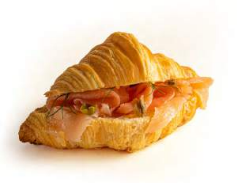
SALMON SUPREME Smoked salmon, cream cheese, capers, dill lemon.