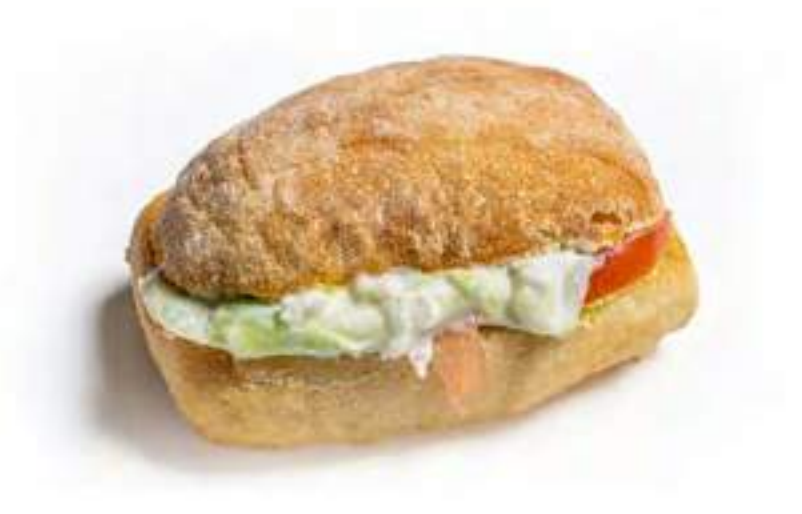
CIABATTA CAPRESE Buffalo Mozarella, tomato, cucumber, pesto mayo.