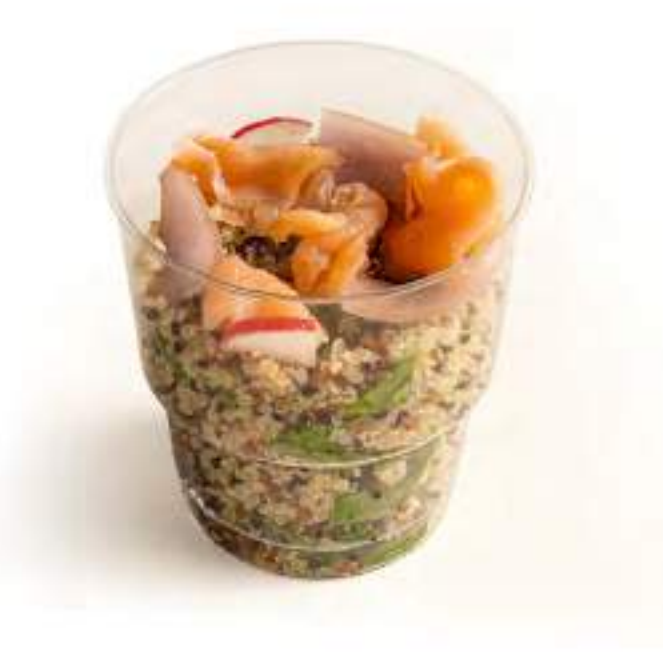
SALMON AND QUINOA pickled red onions, smoked salmon.

KALE-CADO Kale, green apple, avocado, honey, cranberry, apple cider vinegar dressing.