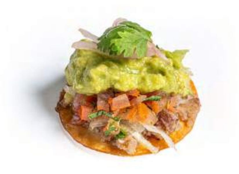
TOSTADA MINI Smashed beans, guacamole, tomato salsa, lettuce.