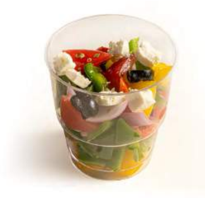
GREEK SALAD Feta, mixed veggies, olives, Greek dressing.