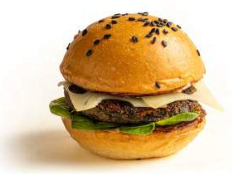
TRUFFLE MUSHROOM Minced mushroom patty, truffle oil, spinach, emmental cheese, brioche bun.