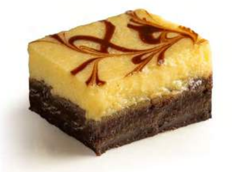
CHESSCAKE Decadent chocolate brownie with cheesecake topping.