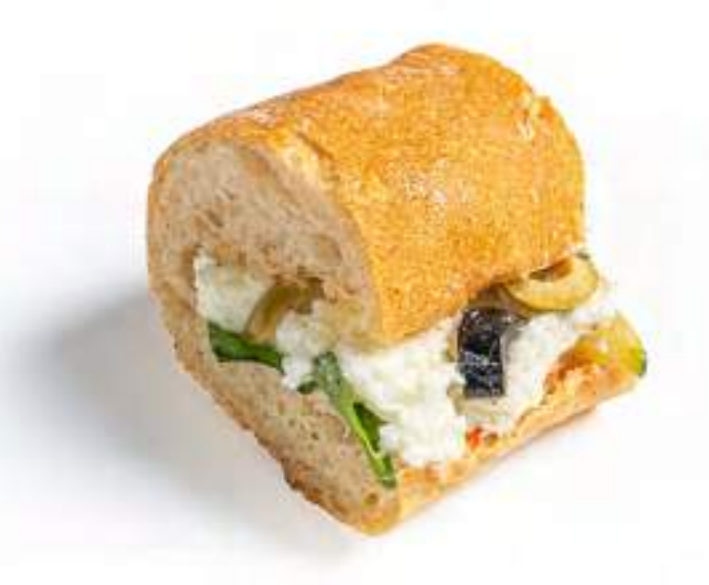
ROASTED VEG BURRATA MINI Roasted Vegetables, Burrata, Spinach, Olives.