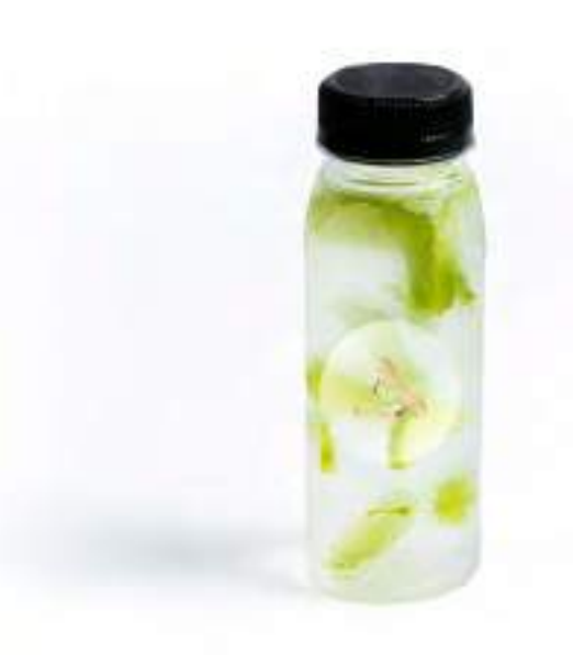
CUCUMBER MINT DETOX