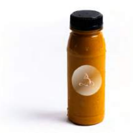
VITAMIN EXTREME Orange, mango, carrot, ginger.