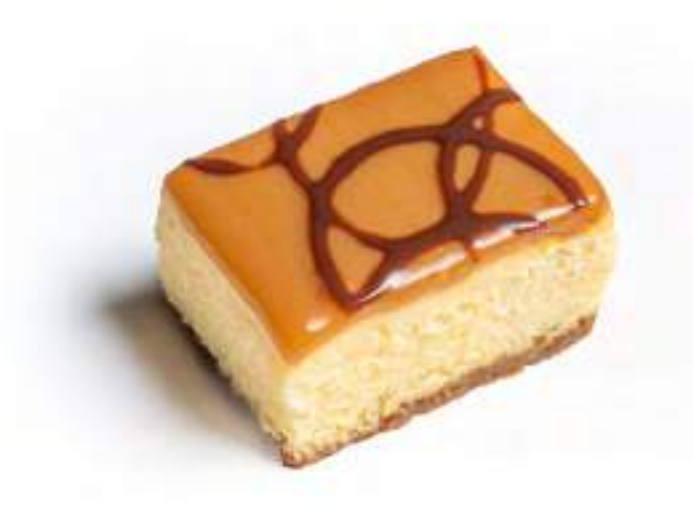
CARAMEL CHEESECAKE MINI