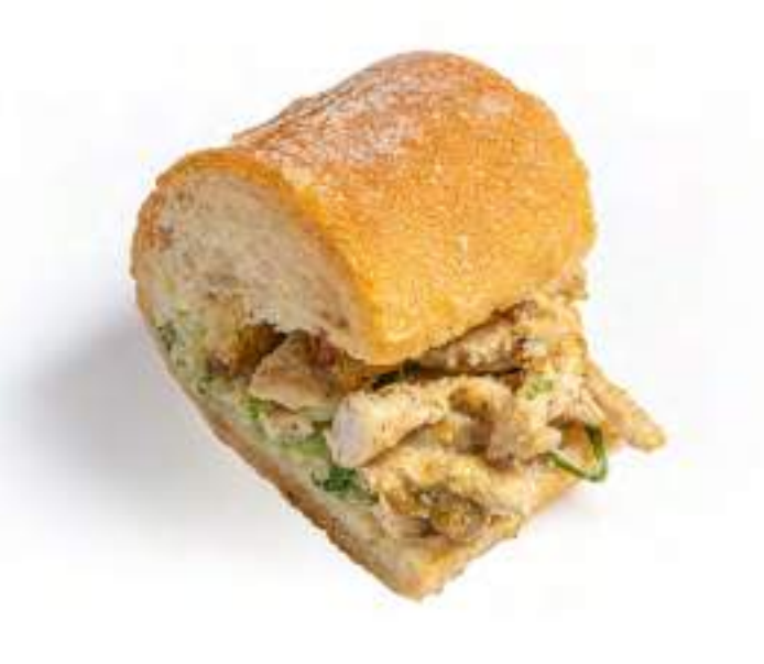
Grilled Chicken, Ranch, Honey Mustard, Lettuce, Parmesan Cheese, Croutons.