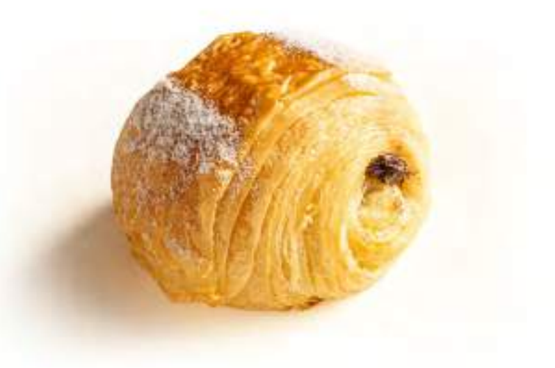
PAIN AU CHOCOLAT Croissant with dark chocolate batons.