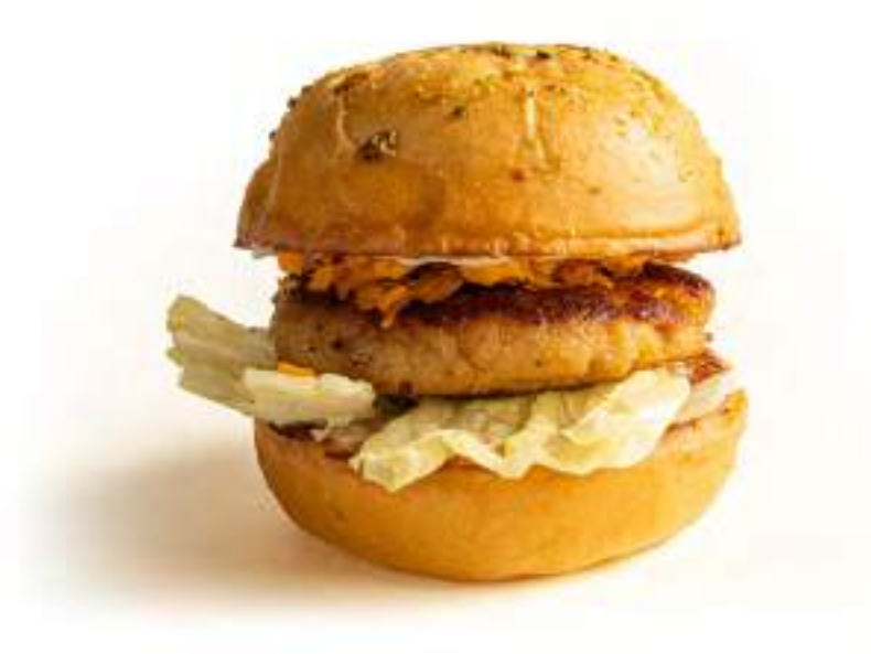
GRILLED CHICKEN Grilled minced chicken patty, iceberg lettuce, ranch, brioche bun.