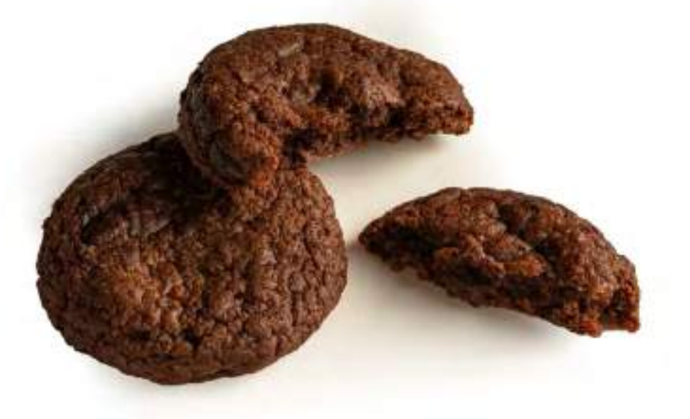
CHOCOLATE FUDGE Indonesian coffee, 54.5% dark chocolate.