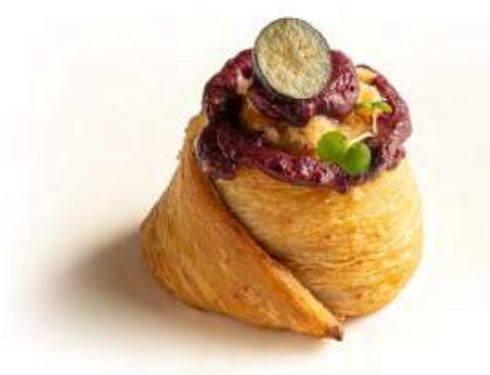
BLUEBERRY CHEESECAKE Cream cheese, blueberries, crumble.