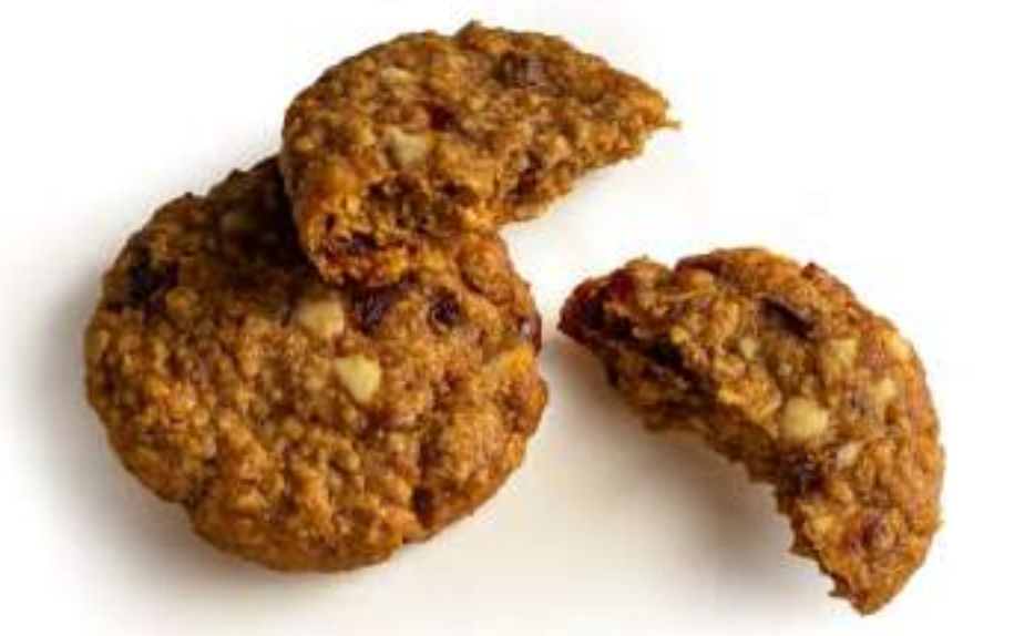
Rolled oats, dried cranberries, 28% white chocolate.