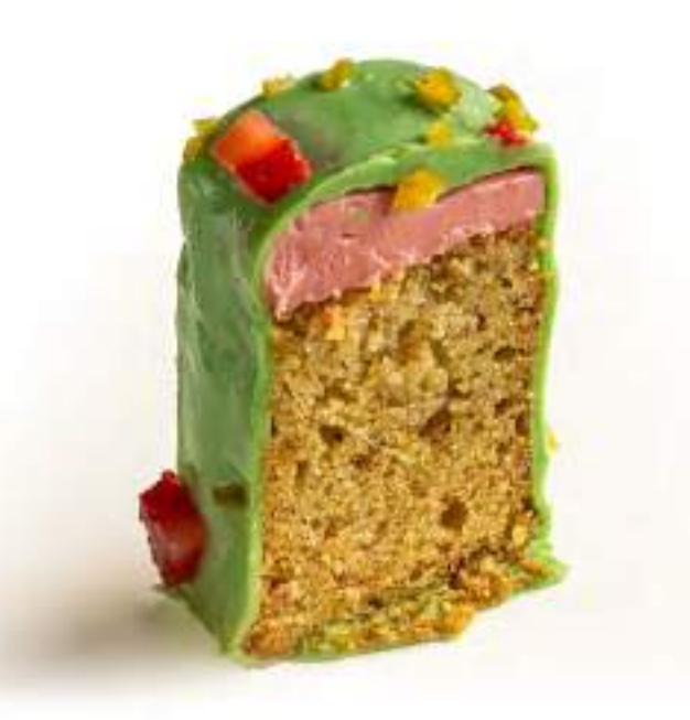
PISTACHIO STRAWBERRY Strawberry ganache, pistachio cake, white chocolate shell.