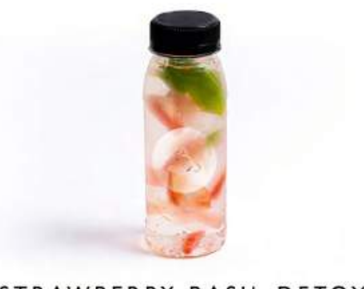
STRAWBERRY BASIL DETOX