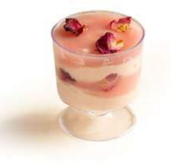
LYCHEE ROSE Lychee rose water mousse, rose petals.