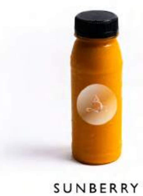
Strawberry, banana, mango.