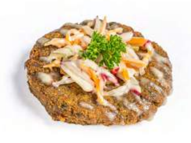
FALAFEL MINI Fried falafel, Pickled veg, Tahina dressing.