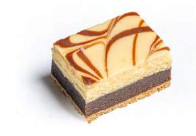
BROWNIE CHEESECAKE MINI