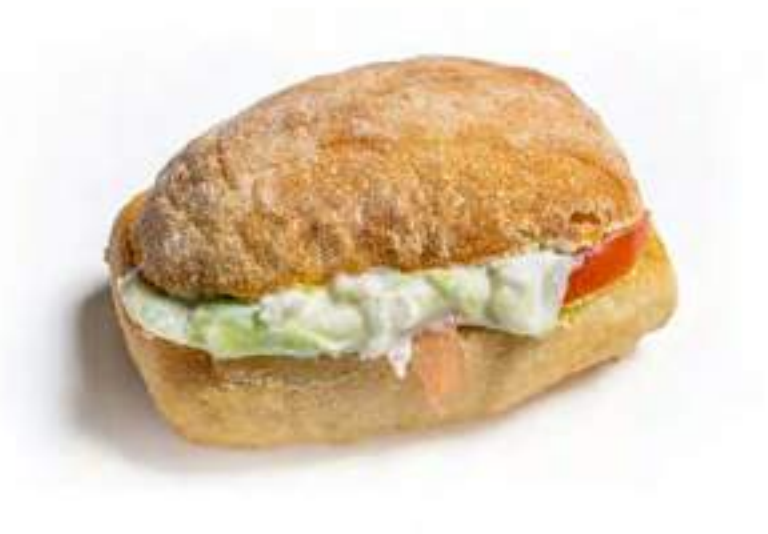
CIABATTA CAPRESE Buffalo Mozarella, tomato, cucumber, pesto mayo.