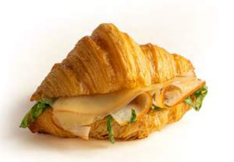
TURKEY AND CHEESE Smoked turkey ham, gruyère cheese, dijon mustard mayonnaise, arugula.