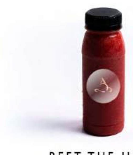
BEET THE HEAT Strawberry, Beetroot, Carrot, Orange.