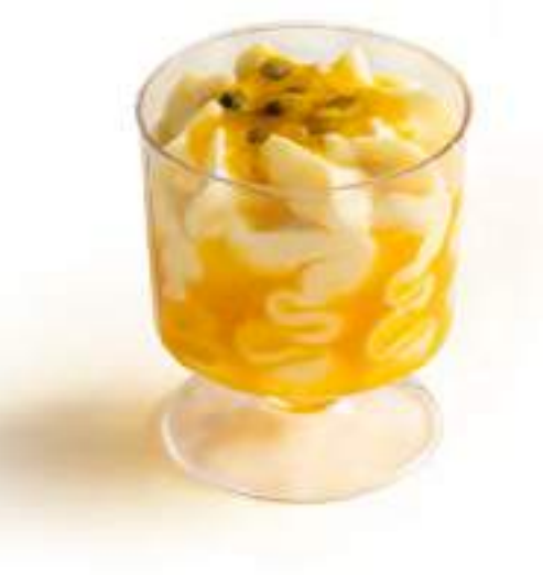
PASSION FRUIT Passion fruit coulis, white chocolate mousse.