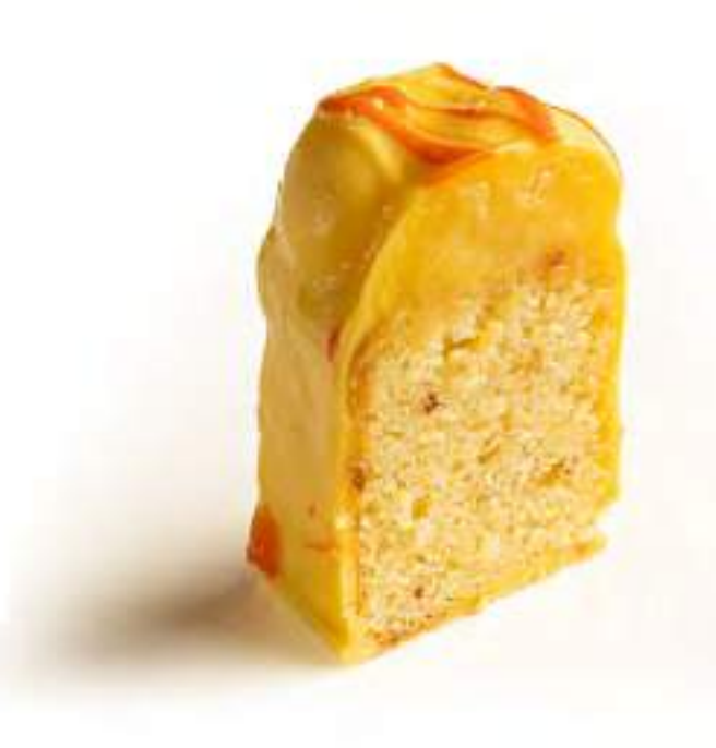
ORANGE PASSIONFRUIT Orange passionfruit ganache, orange passionfruit cake, white chocolate shell.