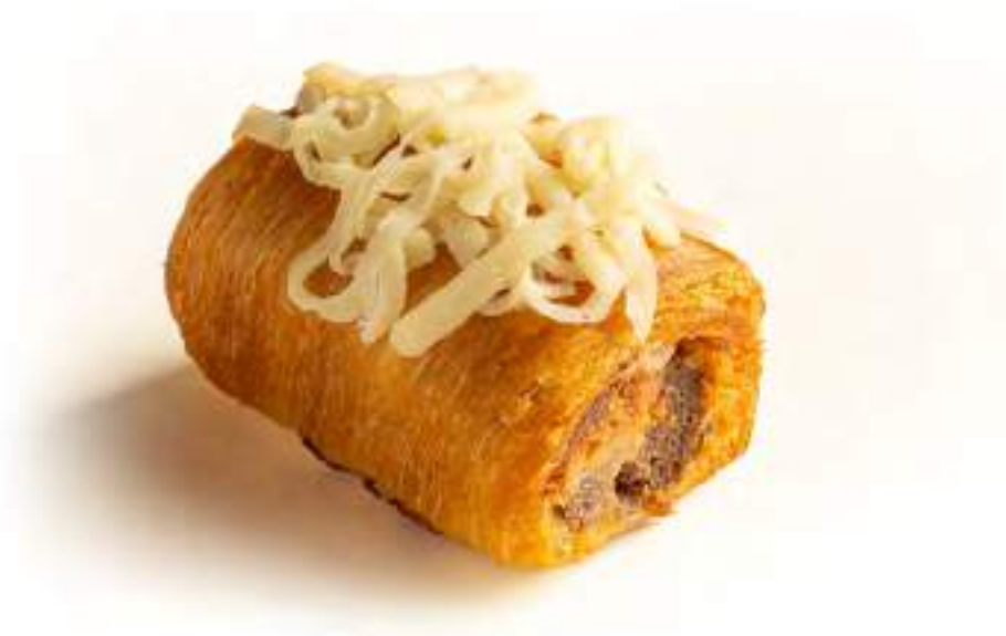
SAUSAGE ROLL Beef sausage mince, onions, house spice blend, mozarella cheese.