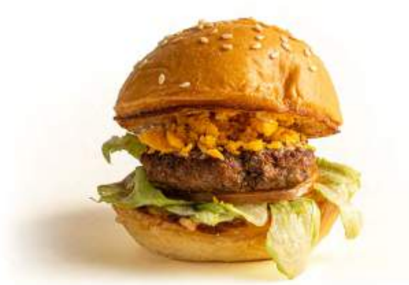
CLASSIC CHEESEBURGER Beef patty, lettuce, tomato, cheddar cheese, brioche bun.