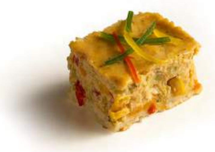
CORN CHEDDAR BROCCOLI Sweet corn, mixed bell peppers,