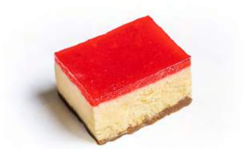
STRAWBERRY CHEESECAKE MINI