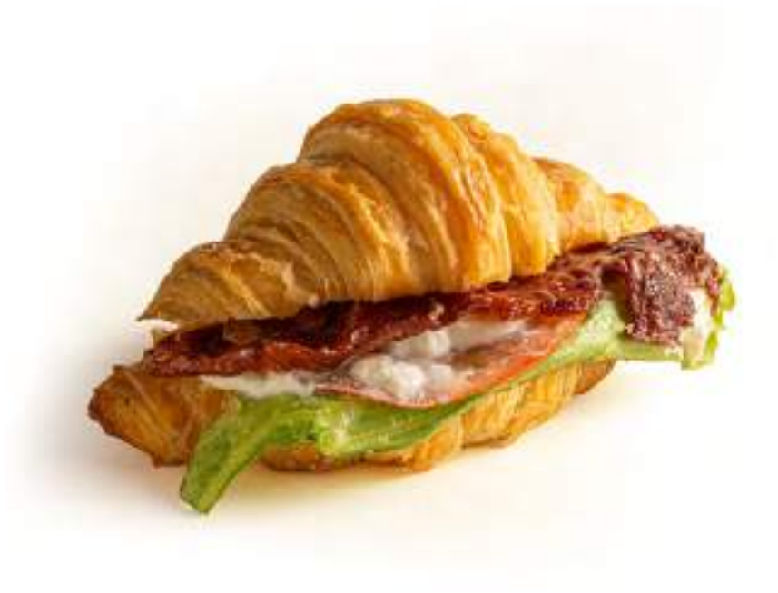
BBLT Beef bacon, burrata, lettuce, tomato.

Includes: Mushroom Munch x2 BBLT x2 Turkey and Cheese x2 Salmon Supreme x2 Halloumi and Avocado x2