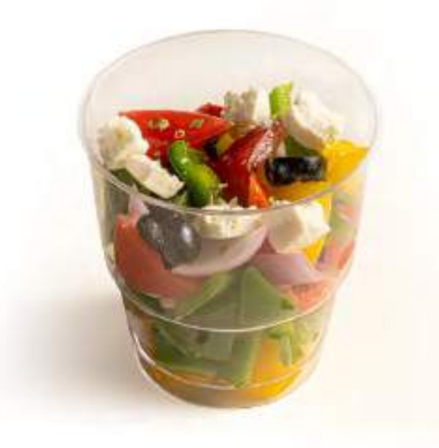
GREEK SALAD Feta, mixed veggies, olives, Greek dressing.