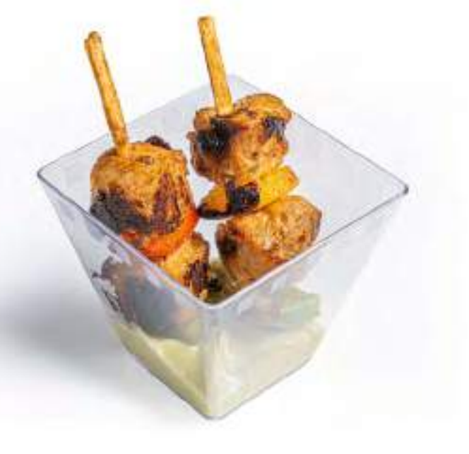
SOYBEAN SOUVLAKI Grilled skewer, cashew herb dip.