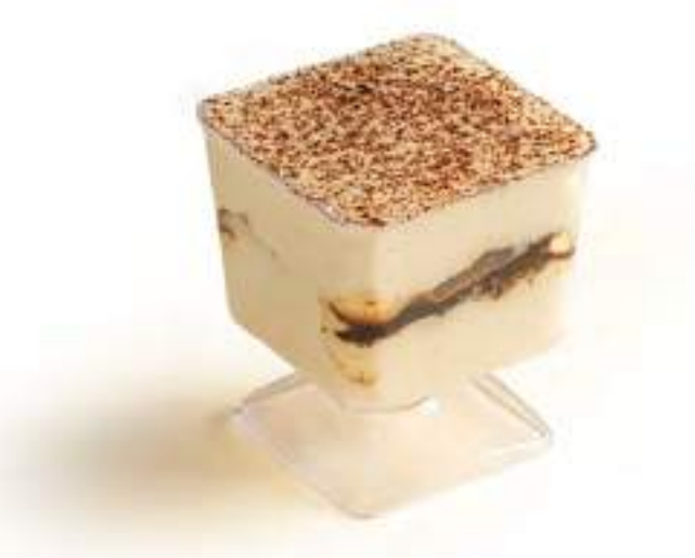
TIRAMISU Espresso soaked ladyfingers, mascarpone mousse.