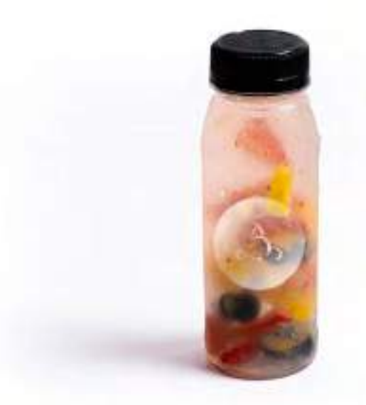
STRAWBERRY ORANGE AND BLUEBERRY DETOX

Strawberry Orange Blueberry Detox Water x3