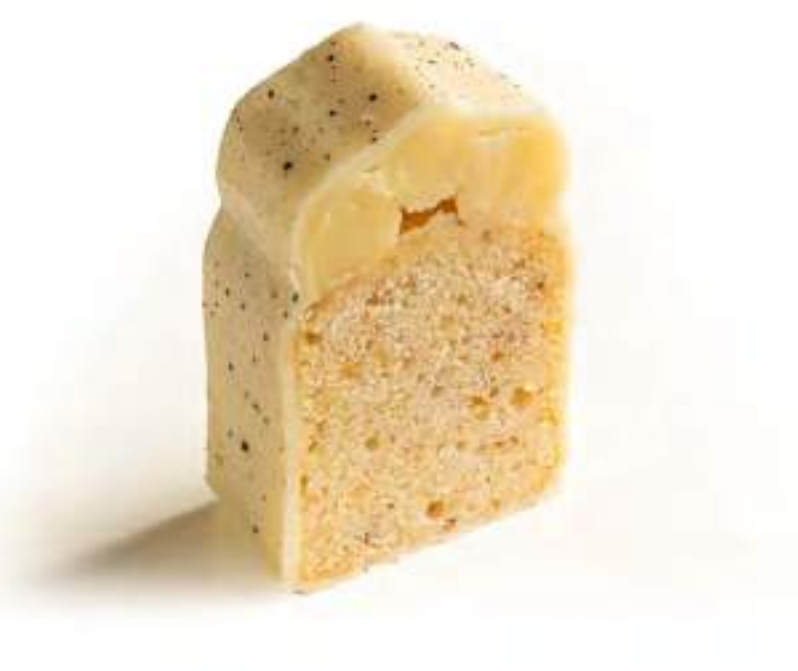
VANILLA TONKA BEAN Vanilla ganache, Tonka vanilla cake, white chocolate shell.