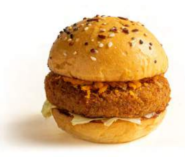
QUINOA POTATO Deep fried quinoa and potato patty, fried onions, iceberg lettuce, brioche bun.