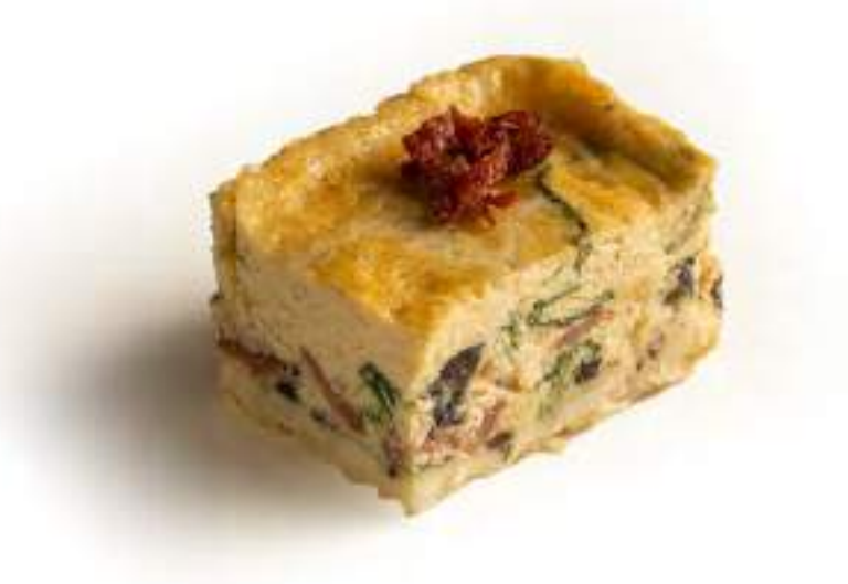
SPINACH BACON ONION Sautéed bacon, spring onions and spinach.