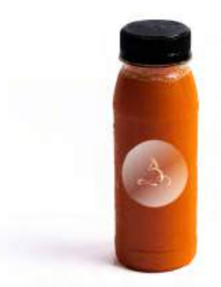
ORANGE AND CARROT Orange and Carrot juice.