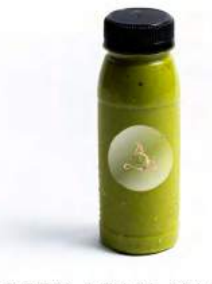
GREEN LEAN MACHINE Spinach, Avocado, Green Apple, Banana.