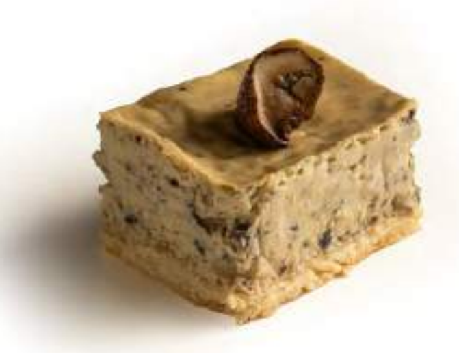
CREAM OF MUSHROOM Creamy mixed mushroom, thyme, garlic, rosemary, onion.