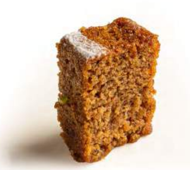
GLUTEN FREE BANANA Moist gluten free banana bread.