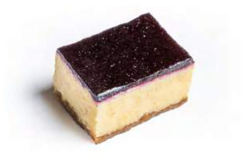
BLUEBERRY CHEESECAKE MINI