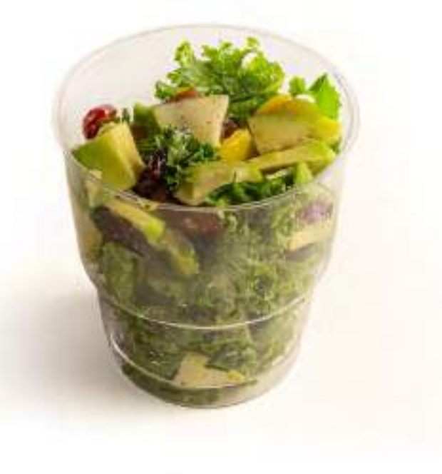
KALE-CADO Kale, green apple, avocado, honey, cranberry, apple cider vinegar dressing.