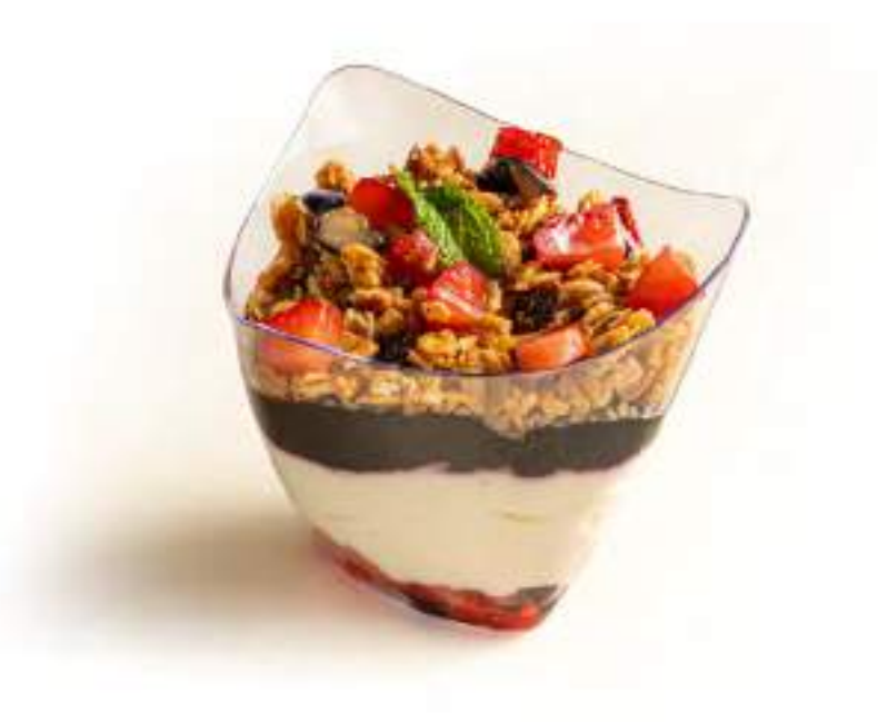
BERRY GRANOLA Yoghurt, fresh berries, homemade granola, berry compote.