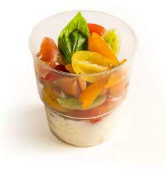
TOMATO-TASTIC Mix cherry tomatoes, mascarpone, balsamic dressing, honey, rosemary, pine nuts.