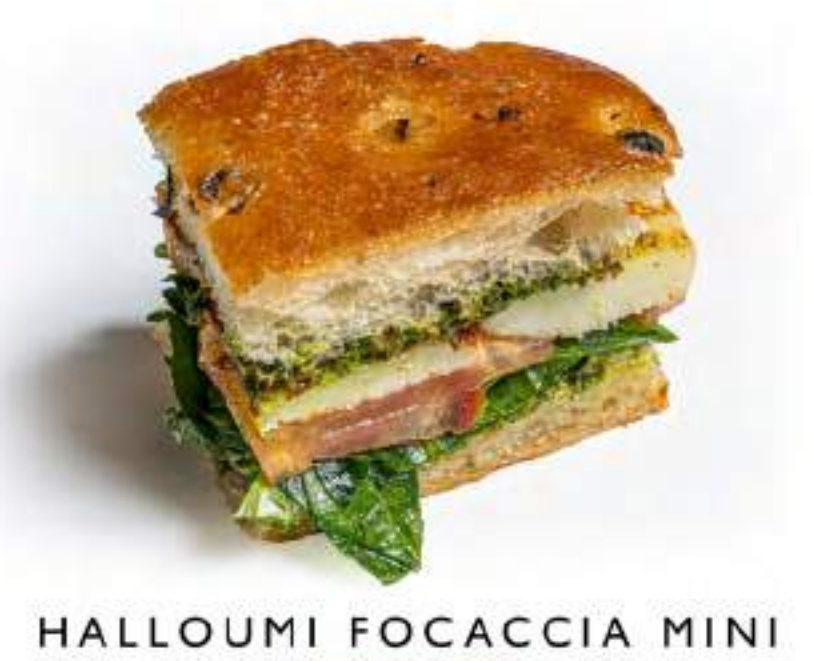
Grilled halloumi, olive focaccia, pesto, tomato, arugula.