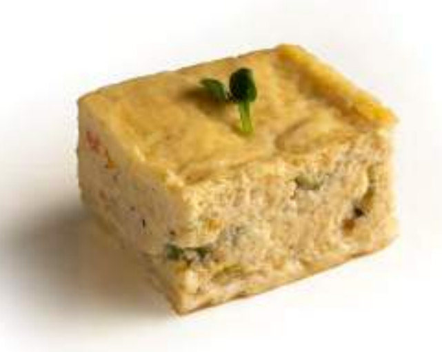
CHICKEN POT PIE Creamy chicken, carrots, peas.