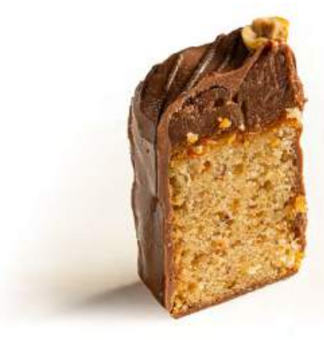
Dark chocolate ganache, hazelnut cake, dark chocolate shell.