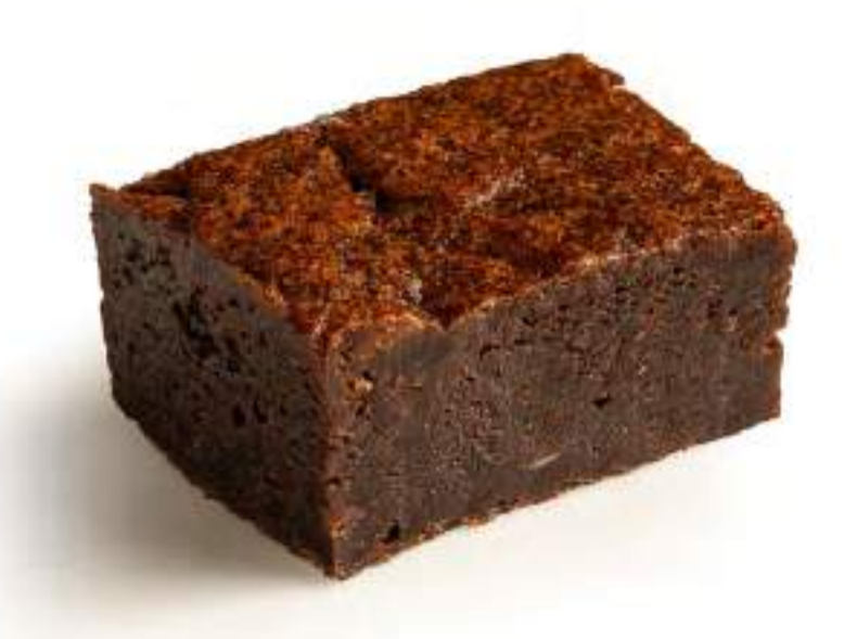
MISO BROWN BUTTER Miso, vanilla, brown butter, burown sugar, salt.