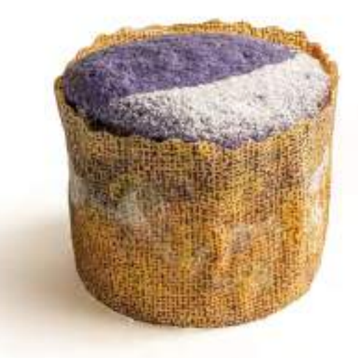
BLUEBERRY YOGHURT Blueberries, buttermilk, yoghurt.