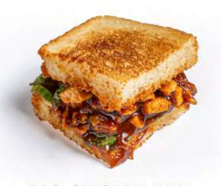
BBQ CHICKEN MINI Home-made BBQ sauce, pulled chicken.