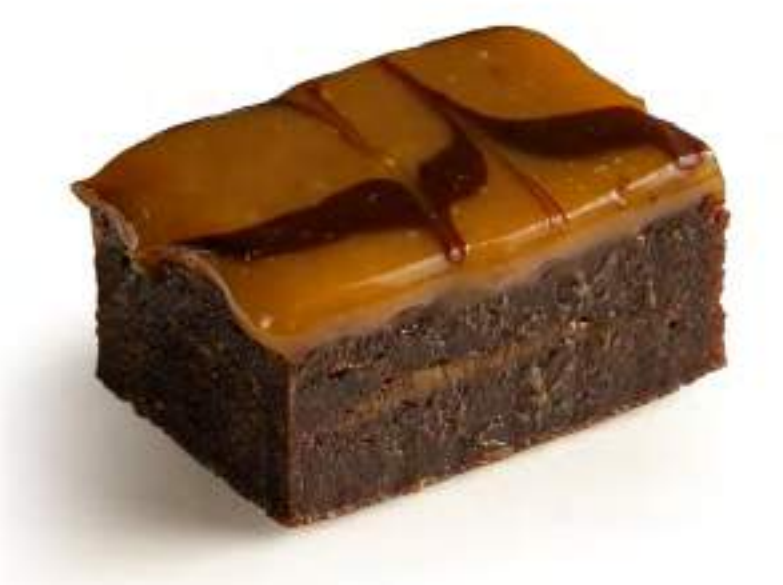
SALTED CARAMEL Decadent chocolate brownie with salted caramel topping.