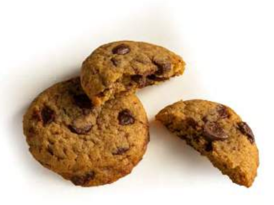
CHOCOLATE CHIP Brown butter, 54.5% dark chocolate chip cookies.