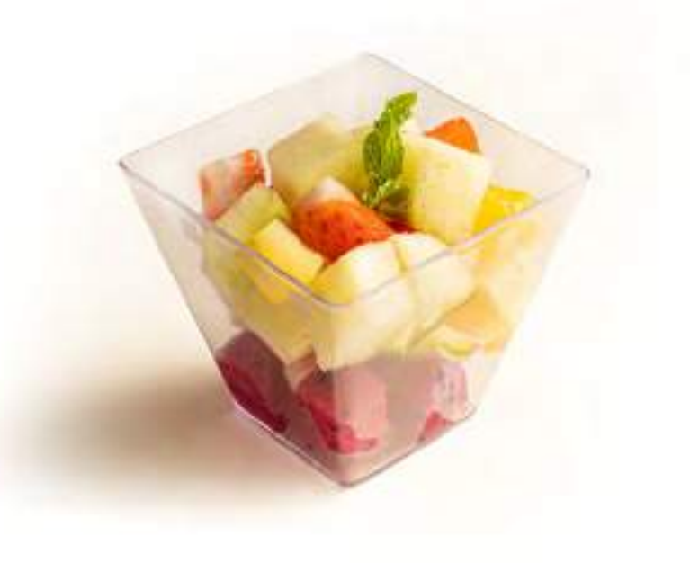
FRUIT SALAD Assorted fresh fruits.