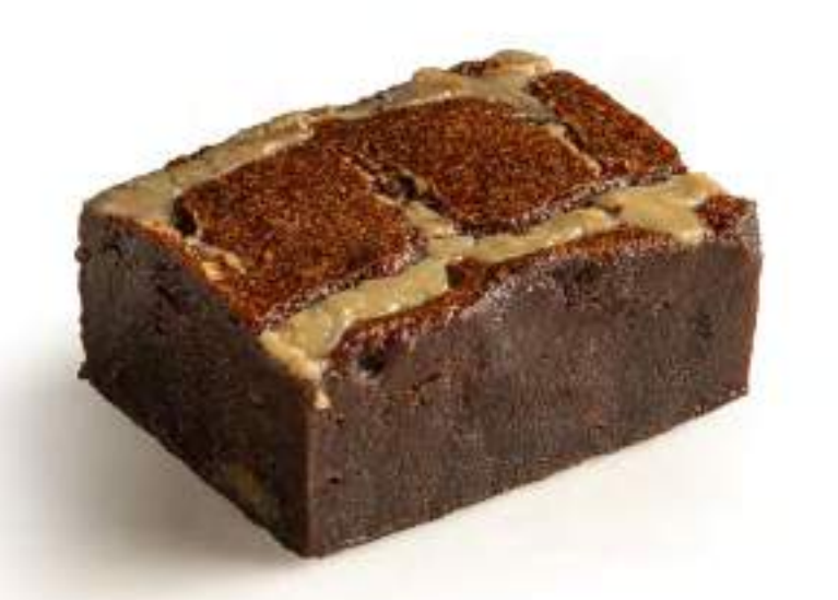
TAHINA HALWA White sesame seed paste, dark chocolate.