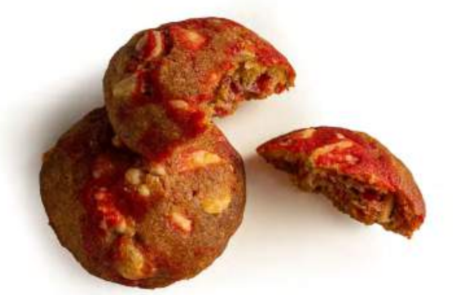
RASPBERRY WHITE CHOCOLATE Raspberries, white chocolate cookie dough.