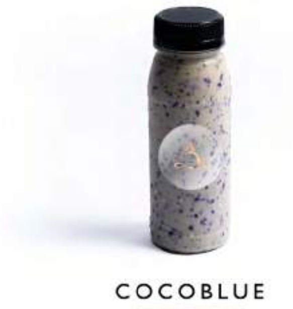
Coconut milk, frozen blueberries, yoghurt, honey.