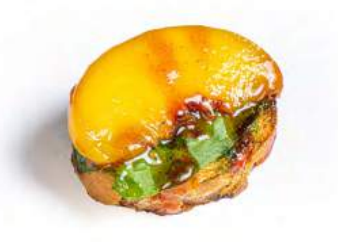
PEACH BRUSCHETTA Vegan pesto, baby spinach, Caramelized peach, Pomegranate dressing.