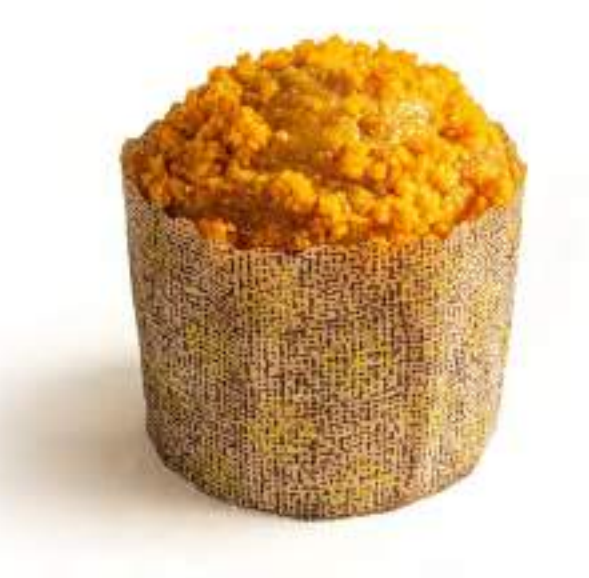
MANGO COCONUT Homemade mango jam, dessicated coconut.