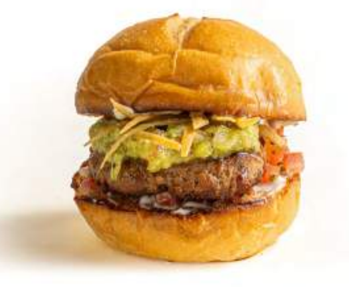
TEX MEX CHEESEBURGER Beef patty, tomato salsa, guacamole, crispy tortilla, brioche bun.