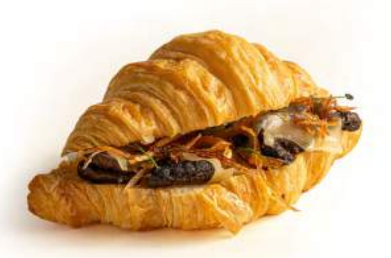
MUSHROOM MUNCH Mixed mushrooms, emmental cheese, truffle oil, friend onions.