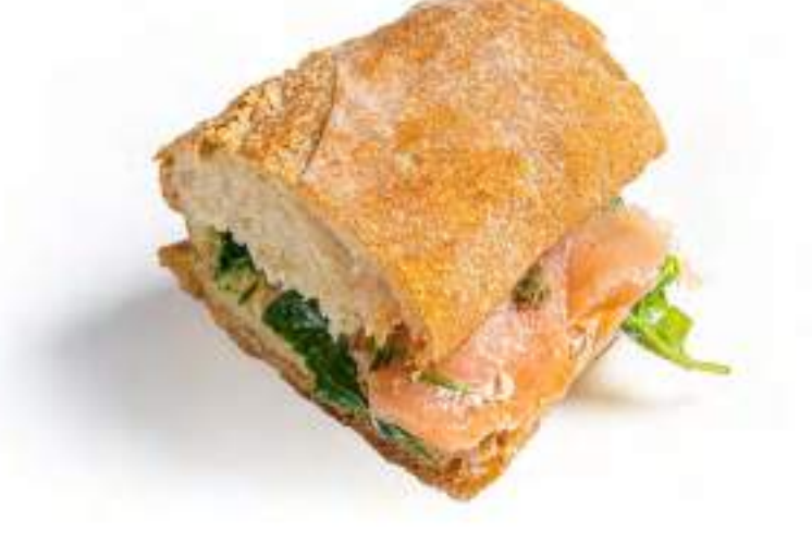
SMOKED SALMON MINI Cream Cheese, Lemon Juice, Spinach, Capers, Dill, Cucumber, Pickled Onion.

Smoked Turkey, Arugula, Emmental Cheese.