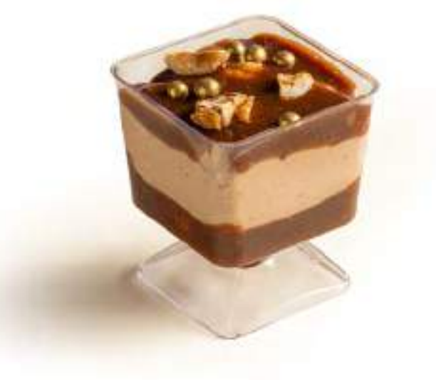
HAZELNUT CHOCOLATE Hazelnut ganache, hazelnut mousse, candied hazelnuts.