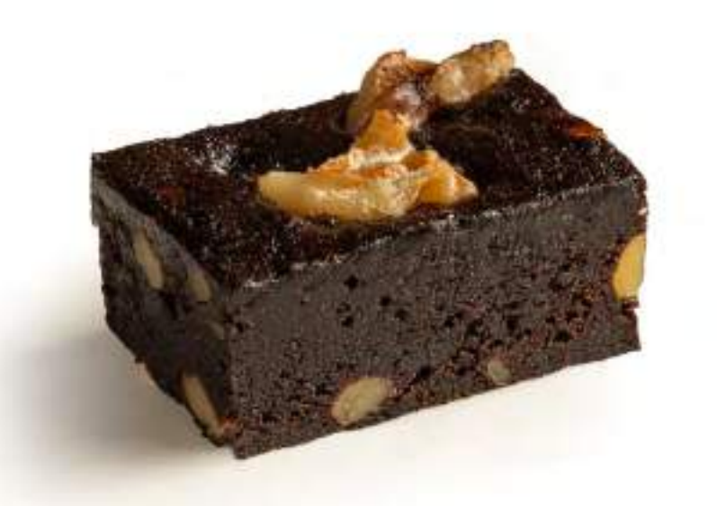
COFFEE WALNUT Roasted chopped walnuts, Indonesian coffee beans.