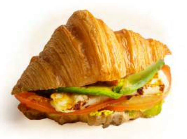
HALLOUMI AND AVOCADO Grilled Halloumi, avocado slices, tomato, multiseed/plain croissant.