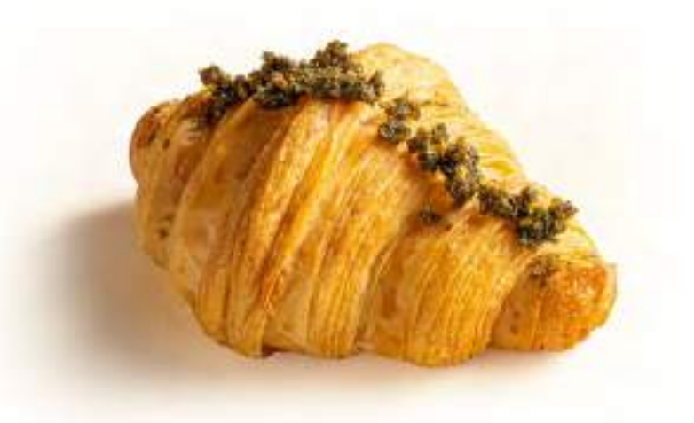
ZAATAR Croissant with Zaatar filling.