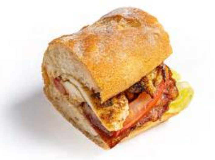
CHICKEN BLT MINI Cajun chicken breast, bacon, lettuce, tomato.