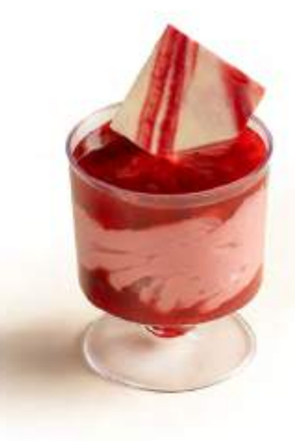
RASPBERRY Raspberry compote, raspberry mousse.