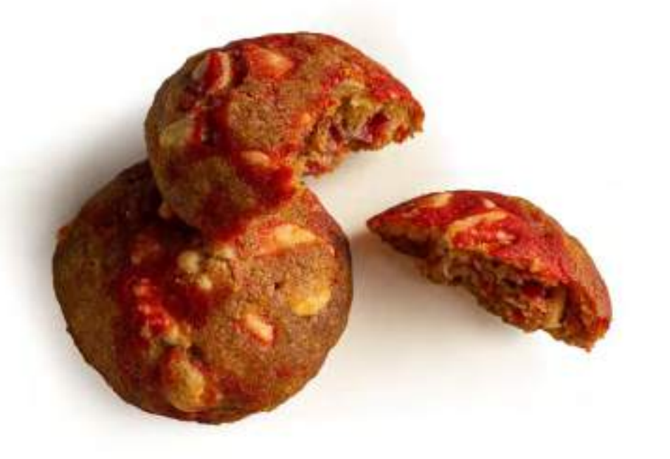
RASPBERRY WHITE CHOCOLATE Raspberries, white chocolate cookie dough.