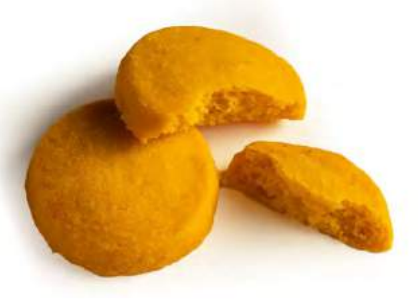
SAFFRON SHORTBREAD Spanish Saffron, Madagascan Vanilla shortbread.