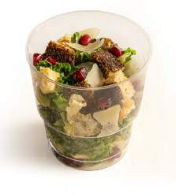
ZAATAR CHICKEN CAESAR Zaatar grilled chicken breast, Parmesan cheese, croutons, iceberg, kale, pomegranate dressing.