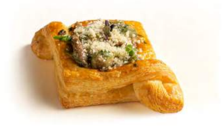
MUSHROOM GARLIC CHEESE Creamy mushroom, spinach, garlic, white onion, truffle, parmesan.