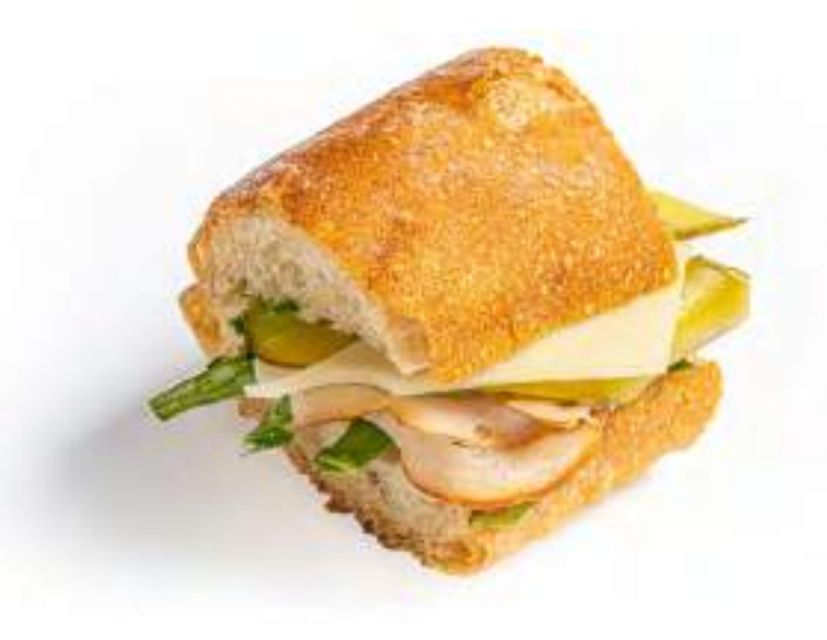
SMOKED TURKEY MINI Pesto Mayo, Tomato Confit, Gherkins,

Smoked Turkey, Arugula, Emmental Cheese.