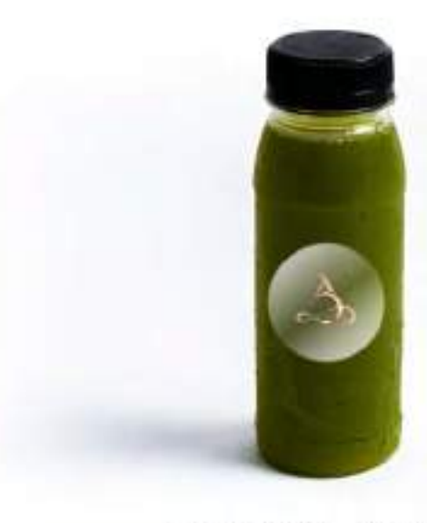
LEMON MINT Lemon mint juice.