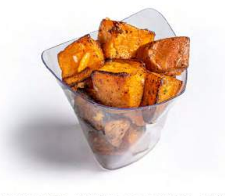
ROASTED SWEET POTATO BITES Roasted sweet potato, chimichurri sauce.