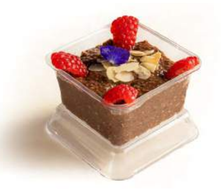
CHIA CHOCOLATE PUDDING Chocolate chia pudding, berries.

Oats, milk, yoghurt, apples, pears, banana, roasted hazelnuts, honey, cranberry, lemon.