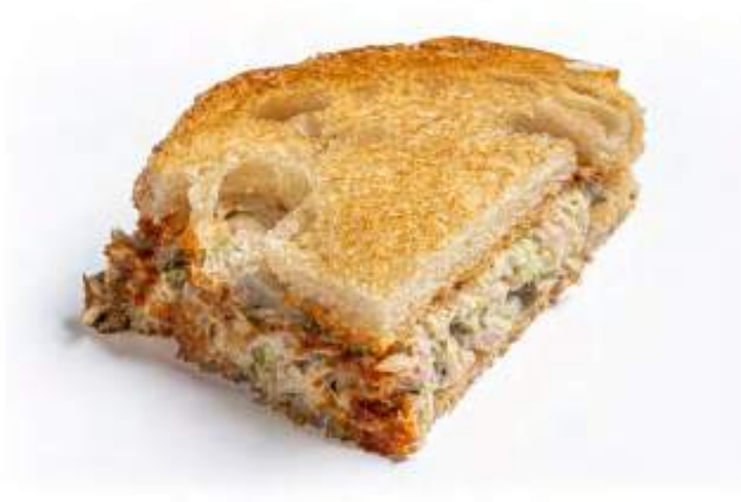
TUNA MELT MINI Shredded Tuna Flakes, Mayonnaise, Lemon, Onions, Cheddar Cheese, Pickles, Dill, Celery.