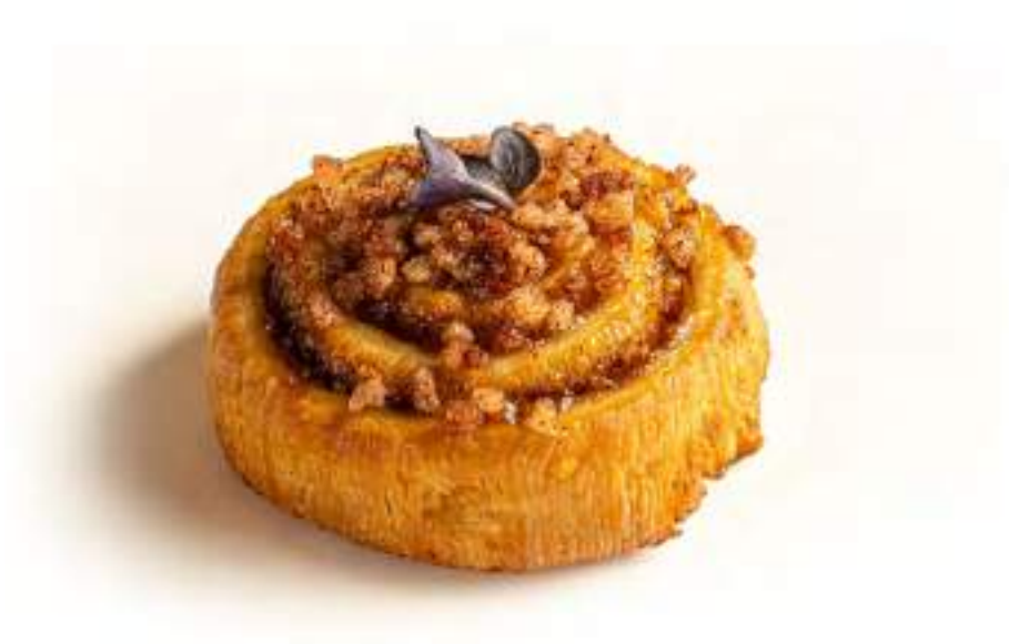
KANELBULLAR Brown sugar, cinnamon, cardamom, pastry cream.