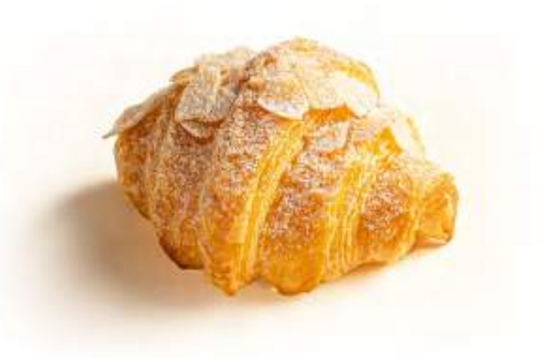
ALMOND Croissant with frangipane filling.