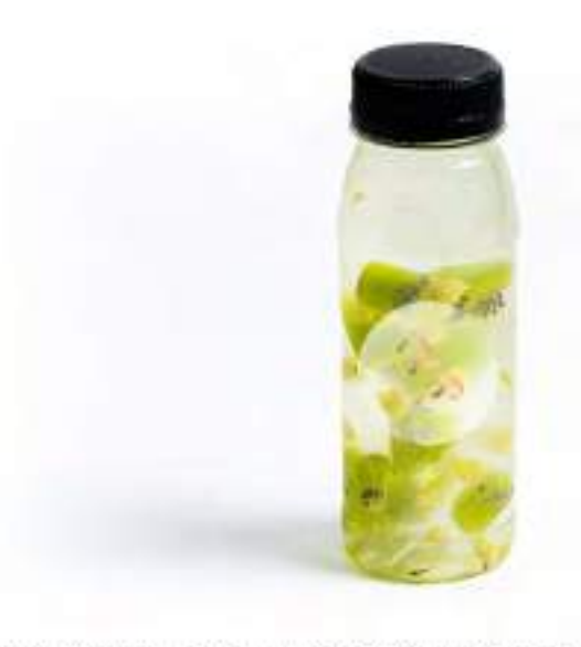
KIWI DRAGONFRUIT DETOX