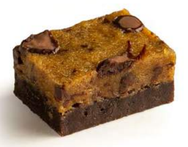
BROOKIE (BROWNIE COOKIE) Decadent chocolate brownie with