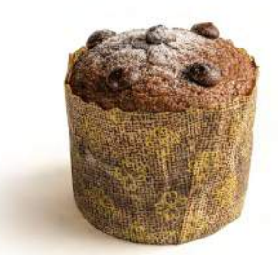
SILKY CHOCOLATE Dark chocolate chips, Indonesian espresso grounds.