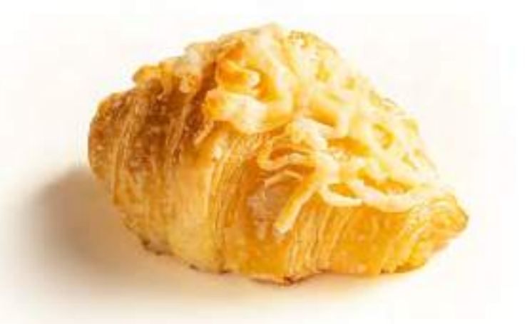
CHEESE Croissant with emmental cheese filling.