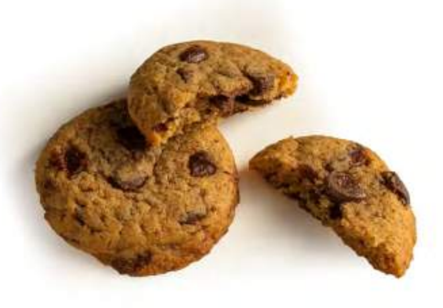
CHOCOLATE CHIP Brown butter, 54.5% dark chocolate chip cookies.