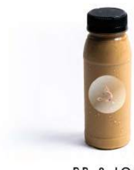
PB & JOE Peanut butter, espresso shot, oats, banana, almond milk.