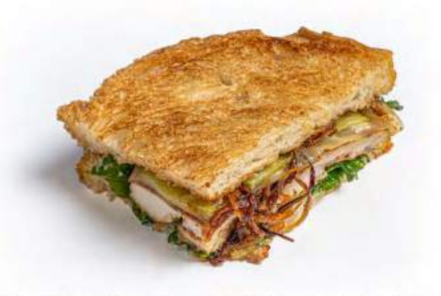
MAPLE CHICKEN SOURDOUGH MINI Smoked maple chicken, banana peppers, emmental cheese, sourdough bread.