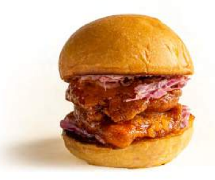
Orange blossom honey, Calabrian chili, seasoned crispy chicken patties, brioche bun, slaw.