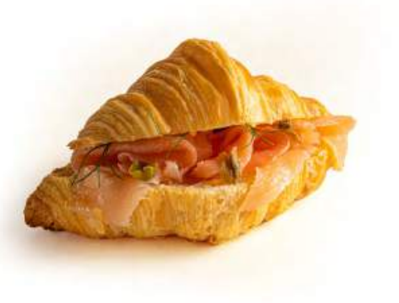
SALMON SUPREME Smoked salmon, cream cheese, capers, dill lemon.