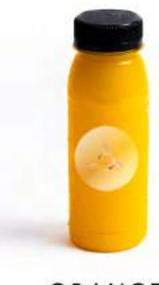
ORANGE Orange juice.