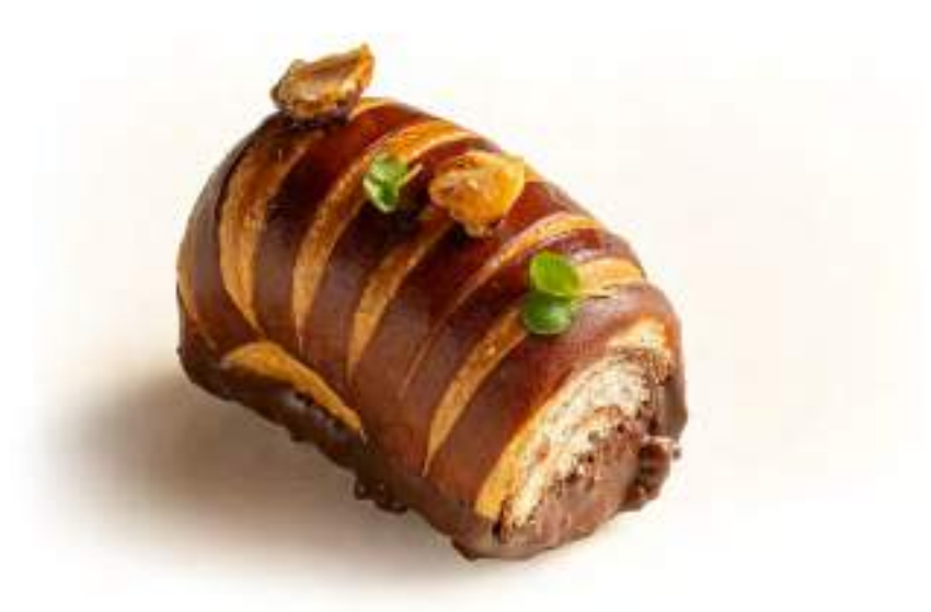
GIANDUJA Home-made hazelnut milk chocolate filling.