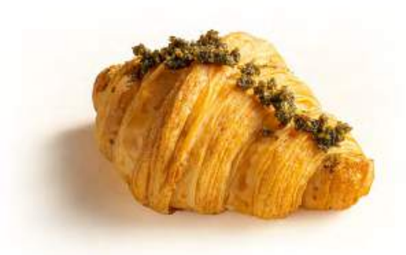
ZAATAR Croissant with Zaatar filling.