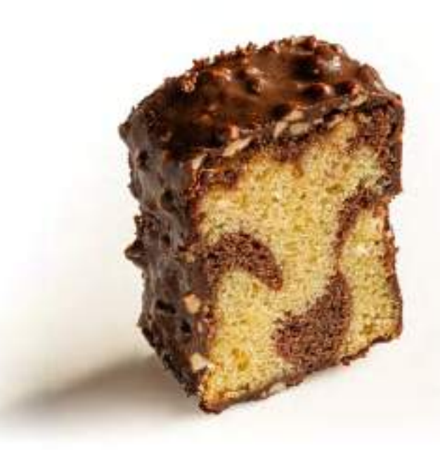
MARBLE Vanilla and Chocolate Marble cake, hazelnut chocolate shell.