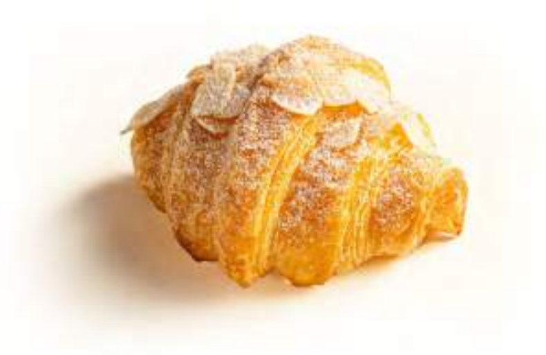
ALMOND Croissant with frangipane filling.