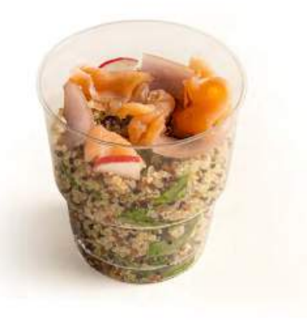
Quinoa, lemon dressing, baby spinach, pickled red onions, smoked salmon.