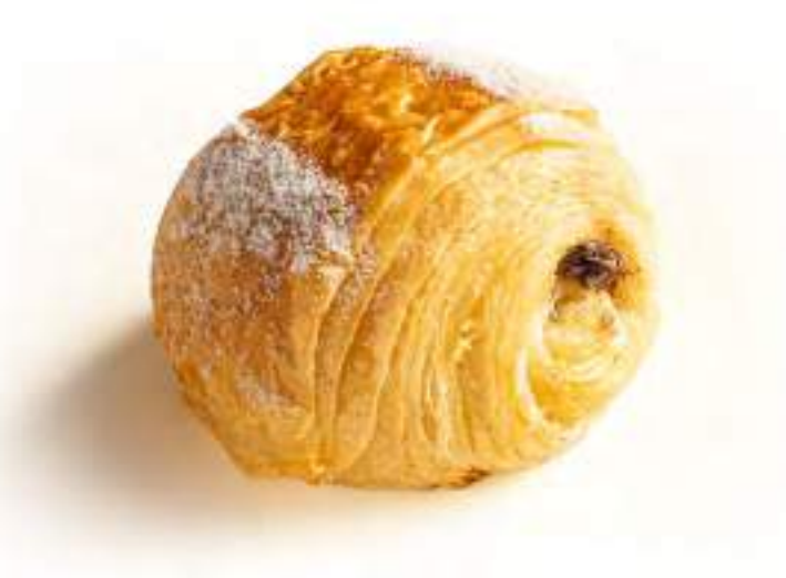
PAIN AU CHOCOLAT Croissant with dark chocolate batons.