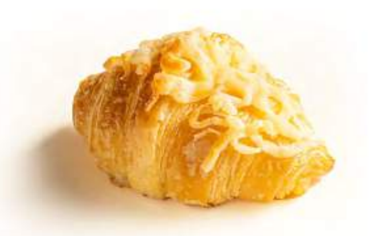
CHEESE Croissant with emmental cheese filling.