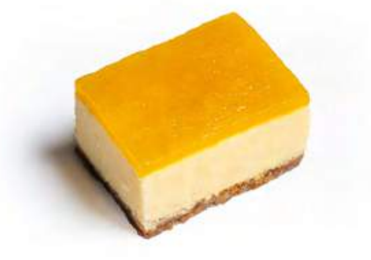
MANGO CHEESECAKE MINI